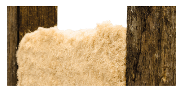
Examples of refurbishment applications with GUTEX Thermofibre®

Profit from the advantages of advanced blow-in technology that is suitable for cavities 15 cm wide and approx. 8 cm deep or greater.