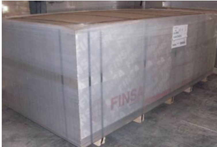
Packed product ready for shipping Melamine faced MDF boards