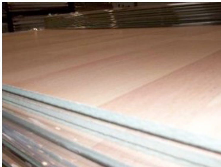
Finished product _ Melamine faced MDF boards