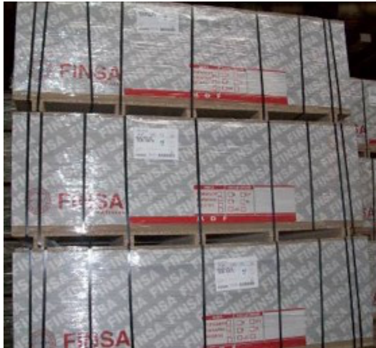
Packed product ready for shipping_ MDF boards