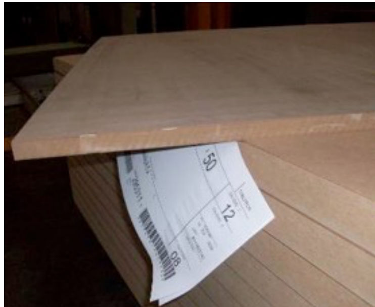
Finished product_ MDF boards